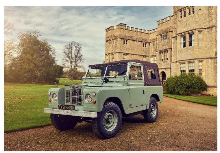
regulations in city location.

Meddling with a national treasure turns out to be not a bad thing!